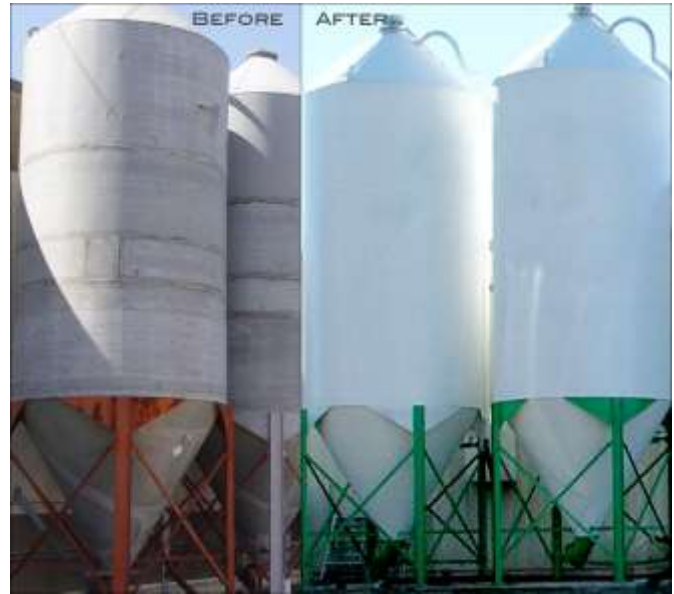
VpCI ® 386 White, applied over weathered galvanized steel offering 10 + years of corrosion protection.

VpCI ® -386 is a clear coating that allows visual inspection of the metal surface after application. It can be easily pigmented with pigment dispersions. The coating is washable, has good chemical resistance and is UV resistant, giving optimal outdoor performance without cracking or chipping upon prolonged exposure to sunlight. It is effective over wide array of substrates; galvanized, carbon and stainless steels, cast iron, aluminum, copper, concrete, wood, plaster and masonry. The product requires minimal surface preparation, compared to conventional primers that require sand blasting.