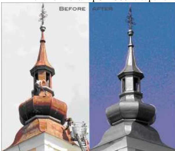
VpCI® 386 Aluminum offering 5 + years of corrosion protection.